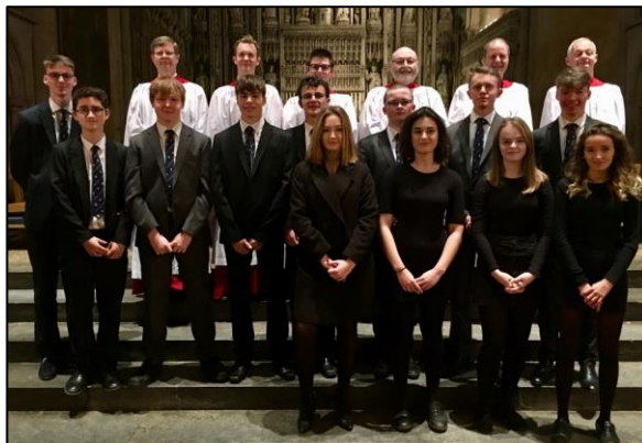
Abbey Singers with the Cathedral Lay Clerks